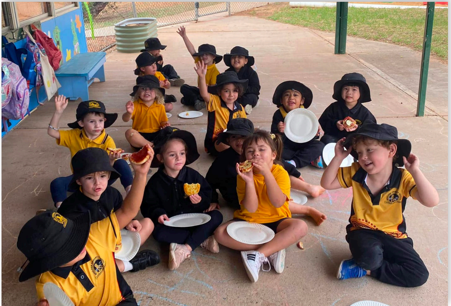
Tjitjiku 1 and 2 enjoying their pizza trolls!